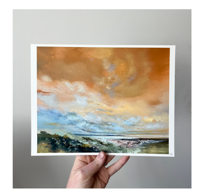
"Blushing Dunes" Print